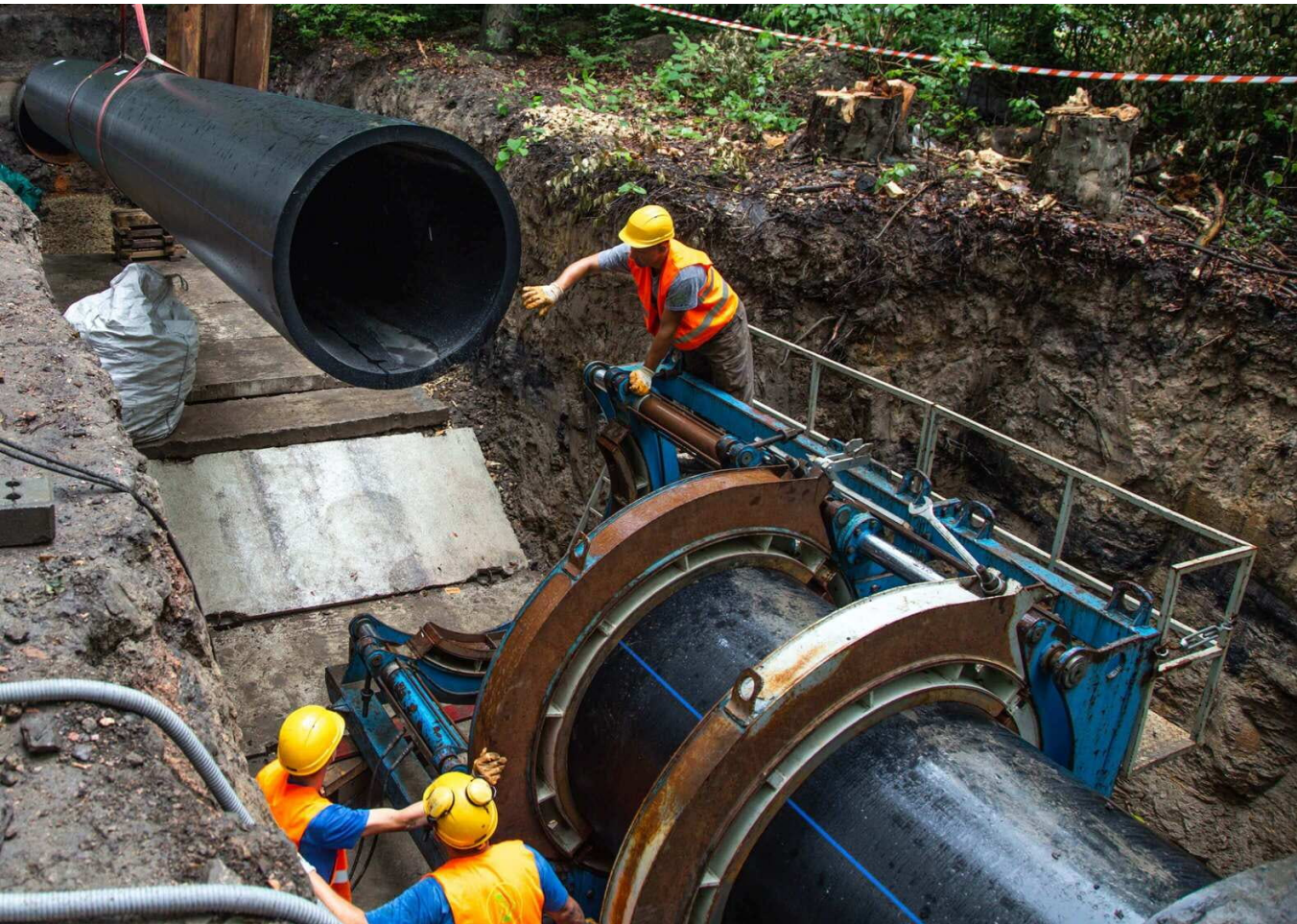
Renovation of a water supply system in an area with mining damage