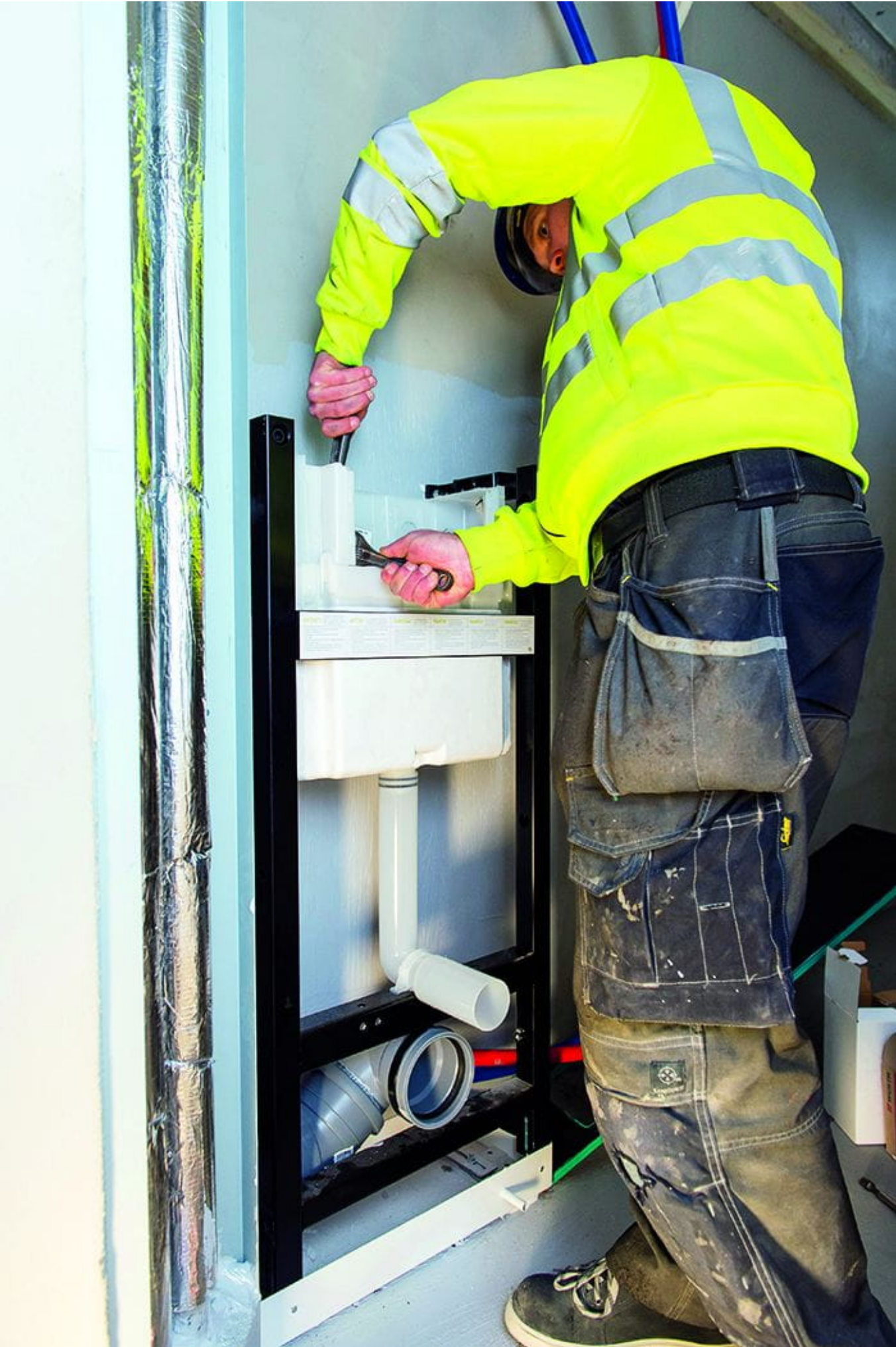
A housing company in Turku saved time and money using Uponor's Cefo pipe overhaul